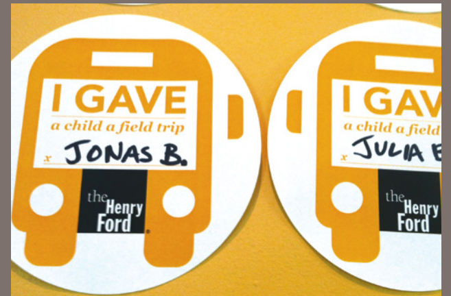
Paper buses that hung in the IMAX lobby when guests donated.