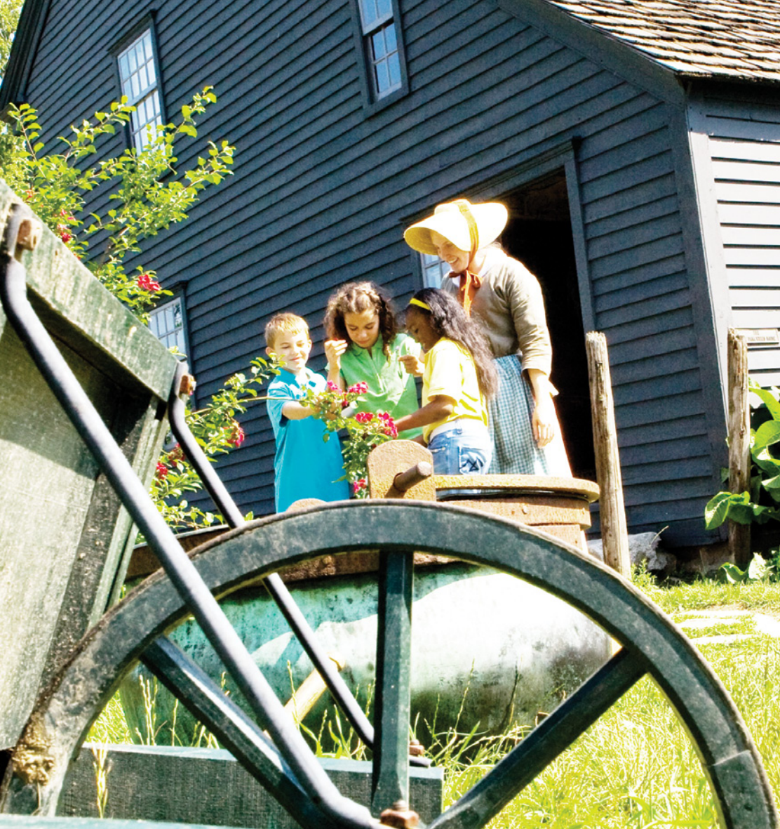
Daggett Farmhouse in Greenfield Village