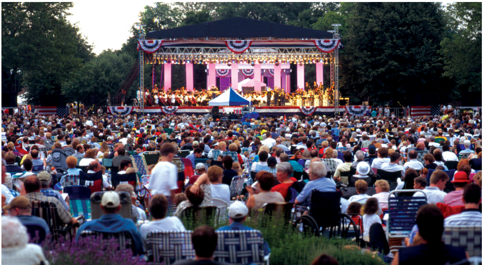
Salute to America, Greenfield Village