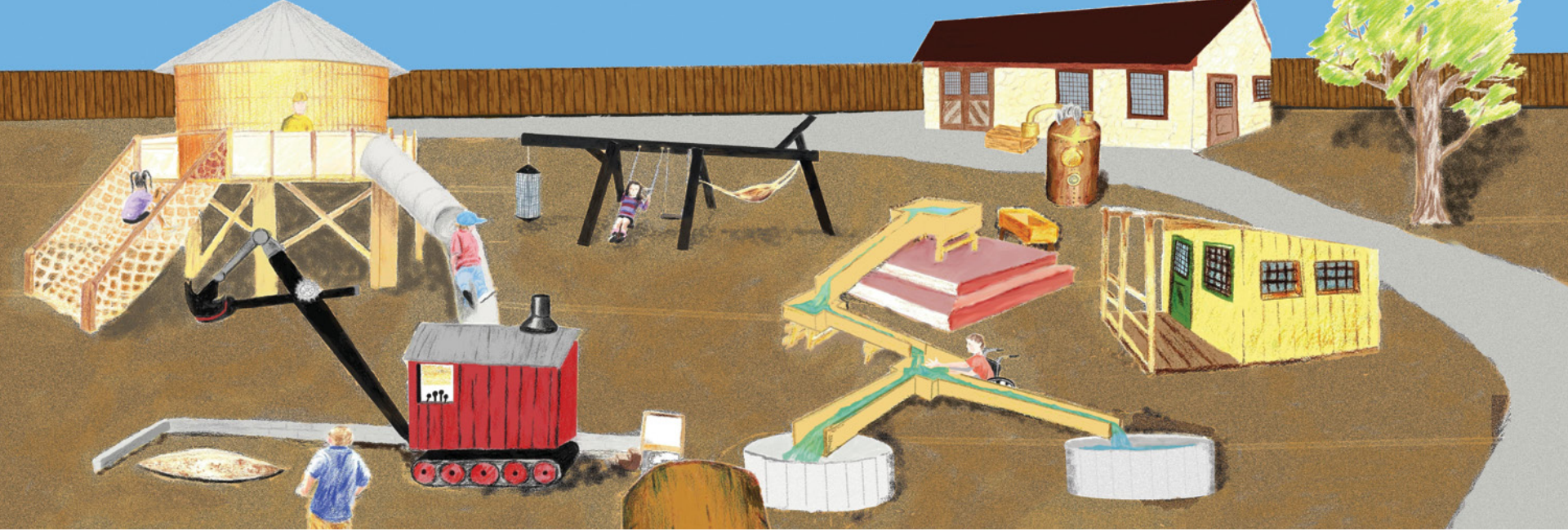
Illustration of the 1920s construction site playscape set to open in fall 2013 in Greenfield Village.