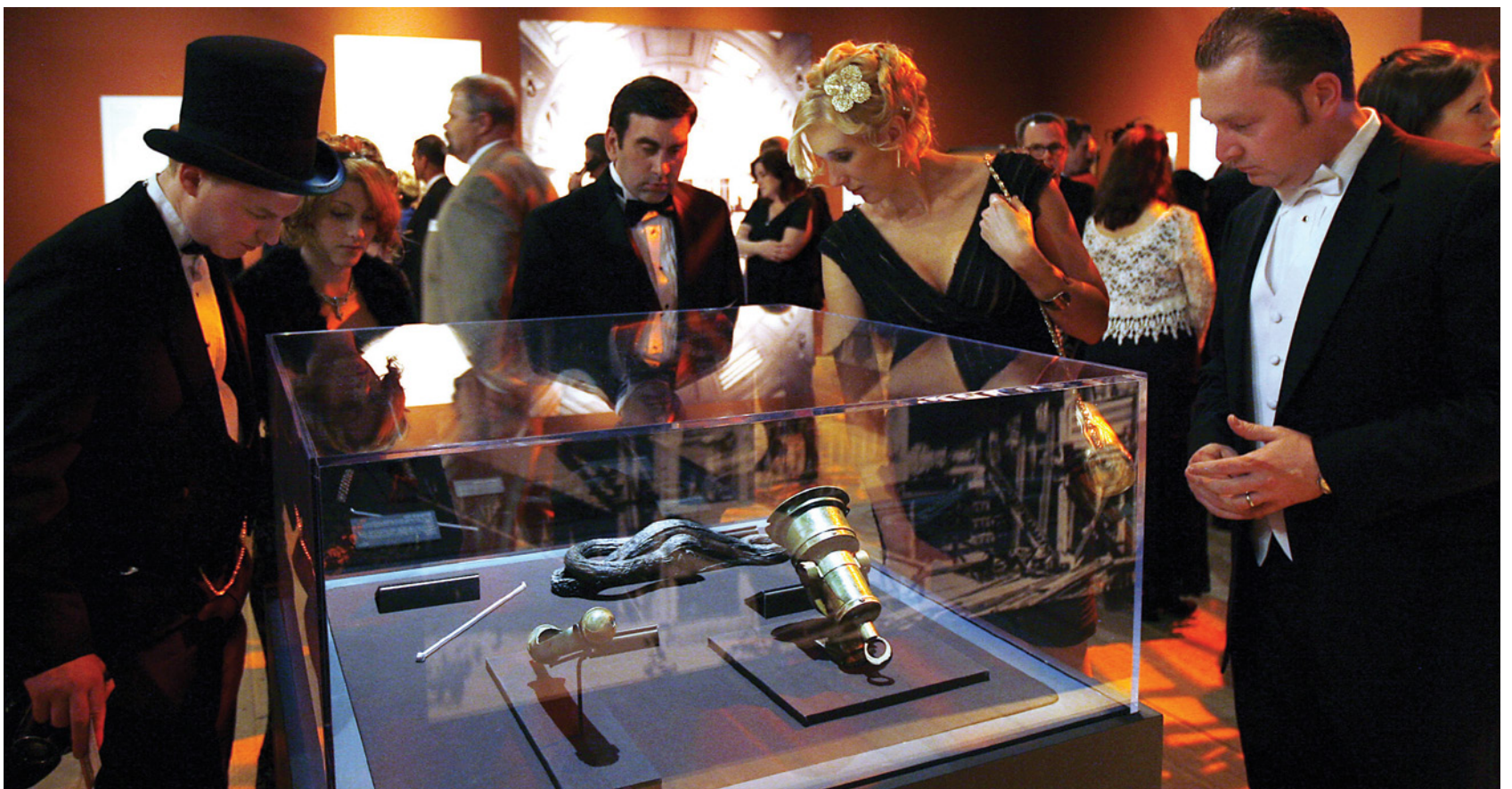
Titanic: The Artifact Exhibition, Henry Ford Museum