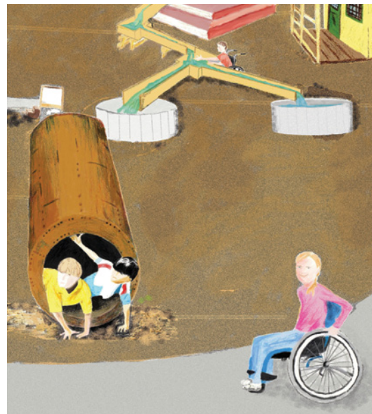
Illustration of playscape designed to accommodate all children.

The kids will love it too, of course. And all of them will be thanking the Koschs when the Village Playscape opens in the fall. •